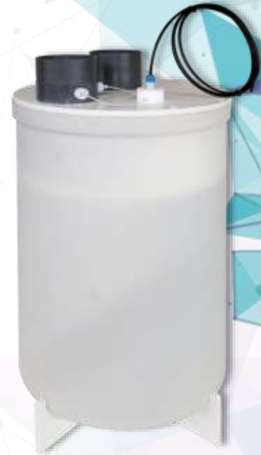
Laboratory Grade Scrubber (18.5 " diameter X 34 " high)

Even if you have a roof-top scrubber, the acid fumes are better handled at the point of source, before they corrode and otherwise damage the conduits and other hardware to the roof-top. Questron's uniquely designed fume Scrubber was developed with our Vulcan product in mind, but it would find application at any place where concentrated and hot fumes are generated, such as in fume hoods. More than 90% efficiency is achieved for most exhaust constituents, such as HNO 3 and HF acids. The unit requires a source of clean water at 1 liter per minute. Package includes an acid resistant exhaust blower that provides exhaust flow through the scrubber at 1000 to 1400 ft per minute.