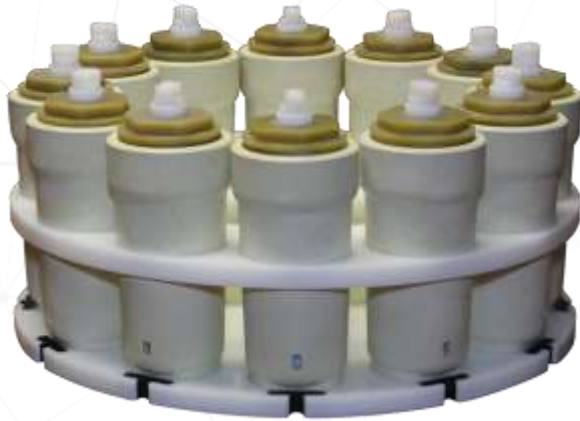
eVHP Vessel Set