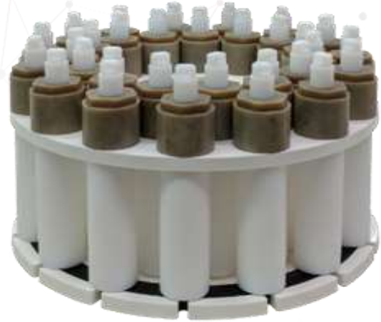
LVHT Vessel Set