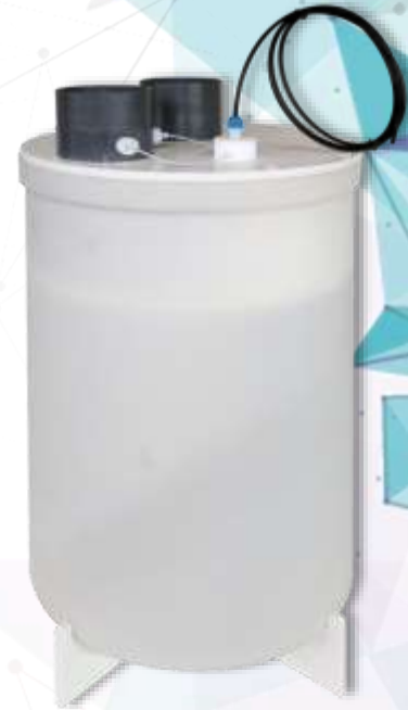
Laboratory Grade Scrubber (18.5 " diameter X 34 " high)

Even if you have a roof-top scrubber, the acid fumes are better handled at the point of source, before they corrode and otherwise damage the conduits and other hardware to the roof-top. Questron's uniquely designed fume Scrubber was developed with our Vulcan product in mind, but it would find application at any place where concentrated and hot fumes are generated, such as in fume hoods. More than 90% efficiency is achieved for most exhaust constituents, such as HNO 3 and HF acids. The unit requires a source of clean water at 1 liter per minute. Package includes an acid resistant exhaust blower that provides exhaust flow through the scrubber at 1000 to 1400 ft per minute.